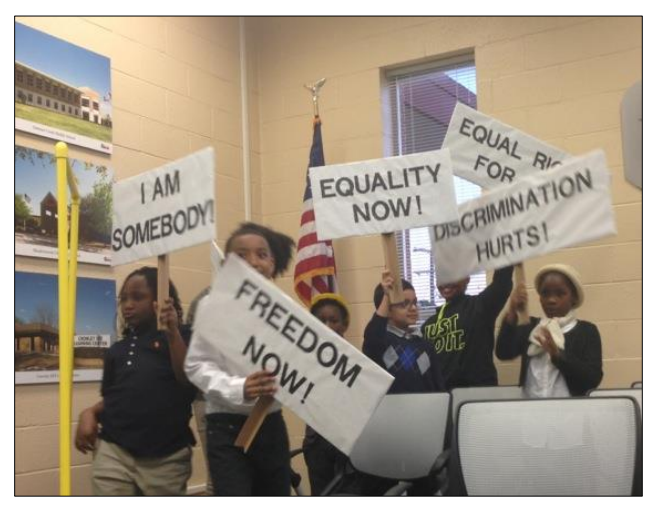
(Rosa Parks skit presented by J.A. Hargrave Elementary students)